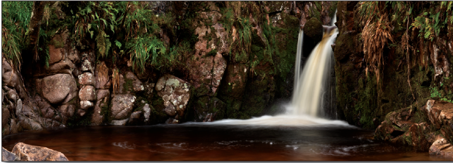
Harthope Linn – Located in the upper reaches of the Harthope Valley a short distance past Langleeford Hope lies this delightful waterfall on the Harthope Burn.