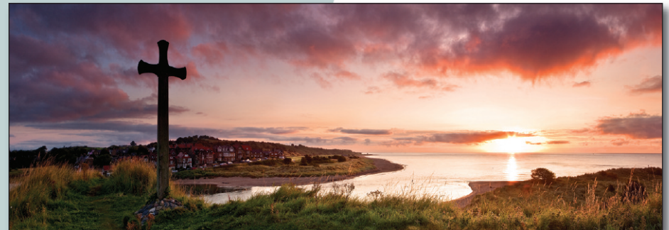
Alnmouth Sunrise – Sunrise from Church Hill, Alnmouth. The village of Alnmouth as the name suggests is located at the mouth of the River Aln. Alnmouth is very popular with holidaymakers and day trippers, attracted by the superb beaches and walking. The cross on Church Hill is a fairly recent one. Church Hill is so called because it used to be the location of the Alnmouth church, which was cut off from the village in 1806 by a huge storm, which actually altered the course of the River Aln.