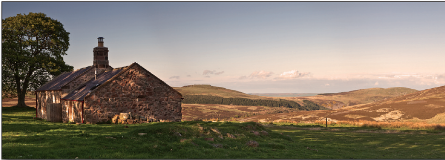
Broadstruther – This is a remote and delightful spot in the Cheviots, consisting of a small copse of trees and the old shepherd's cottage, which has now been converted into a hunting lodge. It must have been a very lonely existence for the original occupants, particularly in the cold winter months.