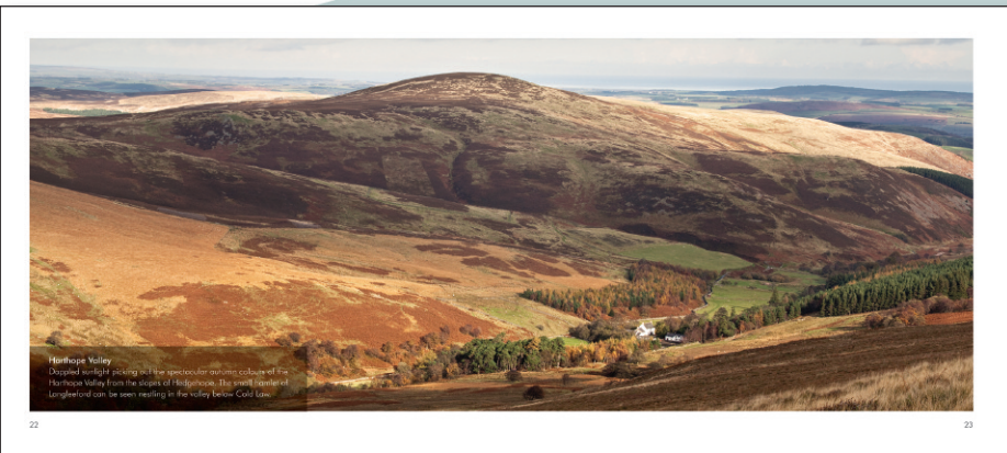
Harthope Valley Dappled sunlight peering in the spectacular narrow gorges of the Harthope Valley from the slopes of Hildgale. The small hamlet of Langleeford can be seen nestling in the valley below Cold Law.