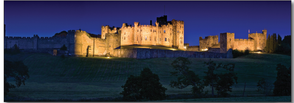
Alnwick Castle Night – The castle just before dawn from the north side.